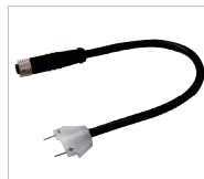
Female Connection Cable